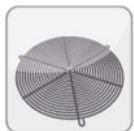
BG Protection guard Air intake grille BG 1000