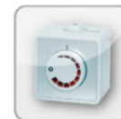
ED Control unit (stepless) (230V)