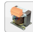
TE / TD Transformer 5 step (in bulk) (230V / 400V)