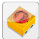
GS On/OFF-switch (230V / 400V)