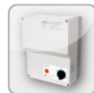
RE / RTE / RTD Control unit (5 steps) (230V / 400V)