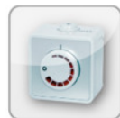
ED Control unit (stepless) (230V)