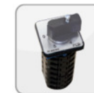
S5 5 step switch (in bulk) (230V / 400V)