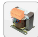
TE / TD Transformer, 5-step (in bulk) (230V / 400V)