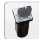
S5 5 step switch (in bulk) (230V / 400V)