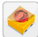
GS ON/OFF-switch (230V / 400V)