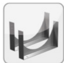
MKA Feet 1 pair